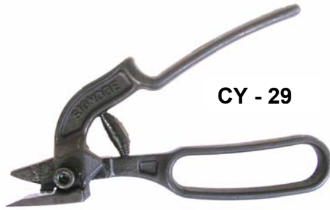
CY - 29