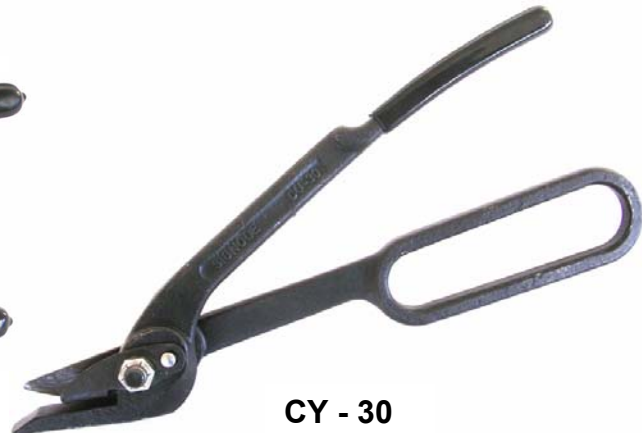
CY - 30