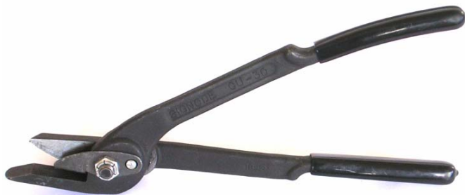
CU - 30